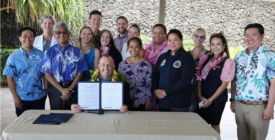
At a June ceremony at Hawai'i Island Community Health Center, Gov. Josh Green signed a number of bills in the company of Hawai'i Island legislators and their colleagues working on health issues, as well as representatives of West Hawai'i's health care community.