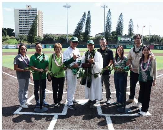
New field blessing at Les Murakami Stadium