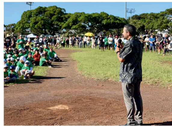
Addressing MYBL players at Opening Day