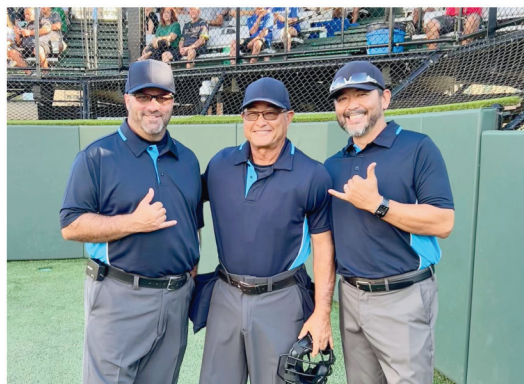
Umpiring a preseason UH Softball game