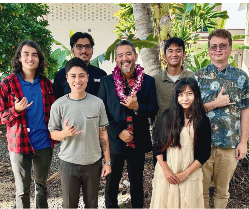
With UH students after hearing on campus