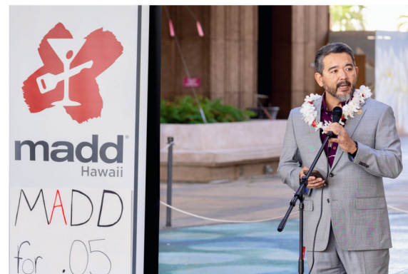
Speaking at a MADD rally at the Capitol