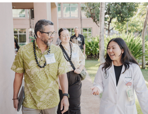
Touring JABSOM with students and faculty