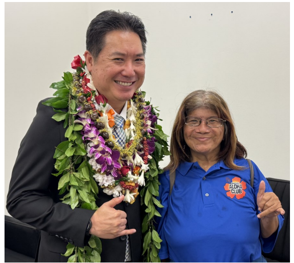
(Top) Representative Chun and Flora from The Waipahu Aloha Clubhouse, who visited during Opening Day.