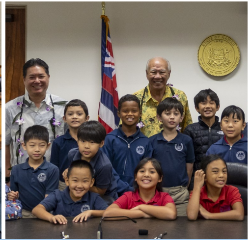
Senator Elefante, Senator Aquino, Representative Takayama, and Representative Chun all came together to give children from Pearl City’s The Children’s House a tour of the State’s Capitol. 3rd, 4th and 5th graders went to the Senate Chambers, House conference rooms, and other places across the Capitol.