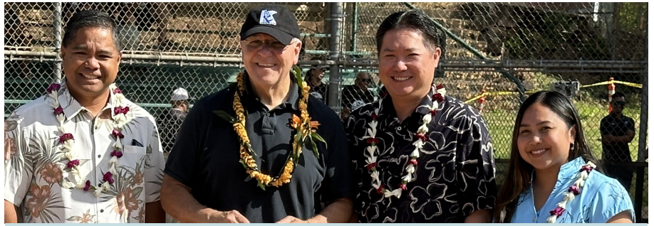
Senator Aquino, Mayor Blangiardi, Representative Chun and Representative Lamosao attended Hans L'Orange Neighborhood Park's Reopening and got to watch several little league baseball games.