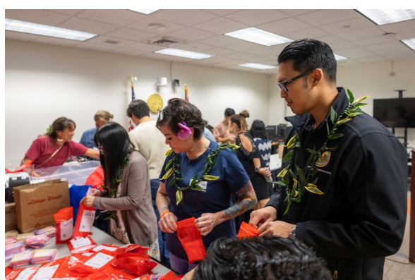
FOOD DRIVE 2024!