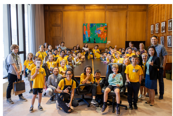
FORT SHAFTER ELEMENTARY VISITS THE CAPITOL!