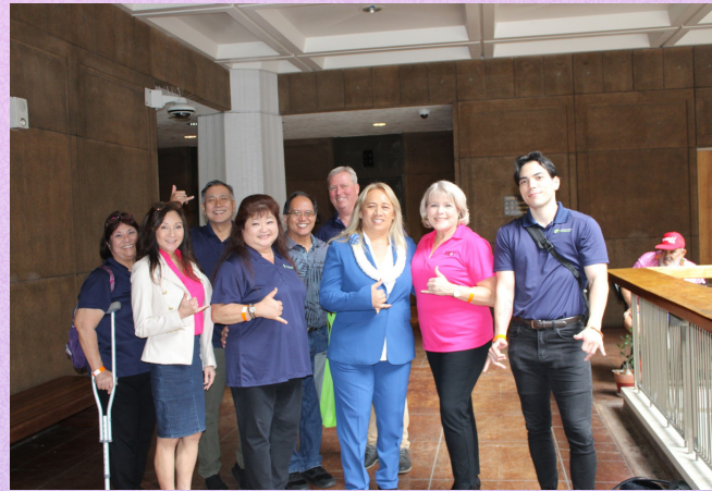
Members of MEO - Maui Economic Opportunity Inc

The Hawaii State Capitol is open to the public and accepting both in-person and online testimony. I encourage you all to voice your opinions on any matter, through whichever method you prefer. My staff and I work year-round to address all of your needs and concerns.