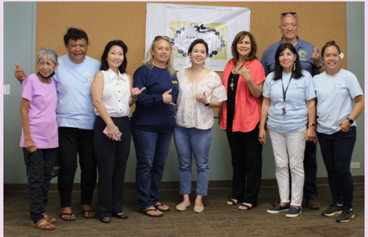
Senator DeCoite and Lieutenant Governor Sylvia Luke attend the 2nd annual Molokai Community Resource Fair with Maui County Mayor Richard Bissen