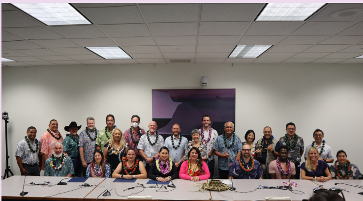
Members of the Senate presenting awards to local small business owners