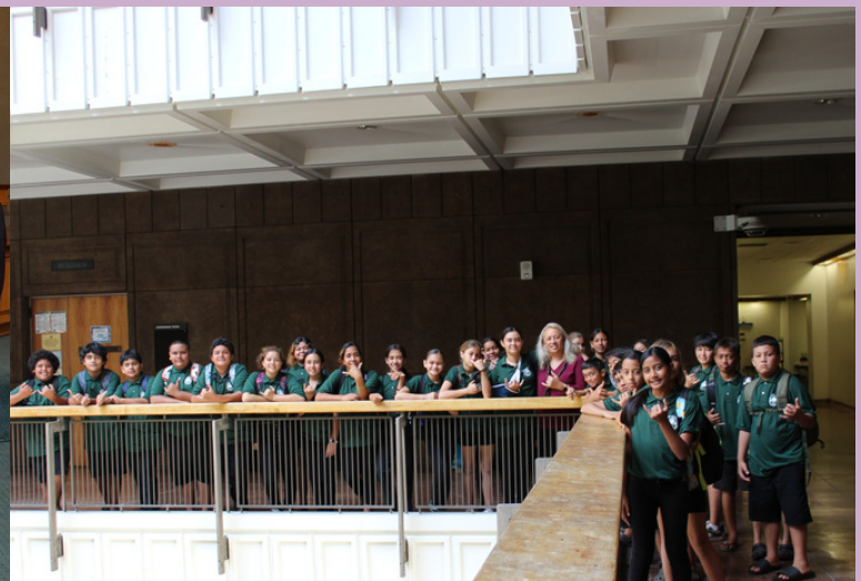
Students from Kula Kaiapuni o Hāna: Papa 5 & 6 meet with Senator DeCoite and take a tour of the capitol