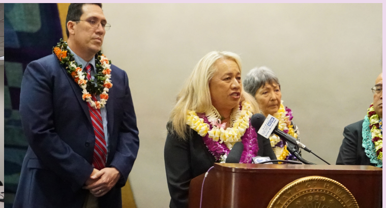
Senator DeCoite shares her thoughts on the 2023 legislative session with Hawaii News Now