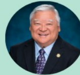
Senator Clarence Nishihara