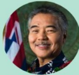
Governor David Ige