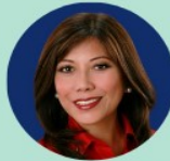
Senator Bennette E. Misalucha