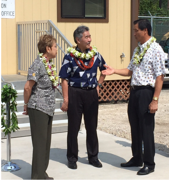
Senator and Governor Ige at the Kawaihae Harbor Dedication, March 2015.