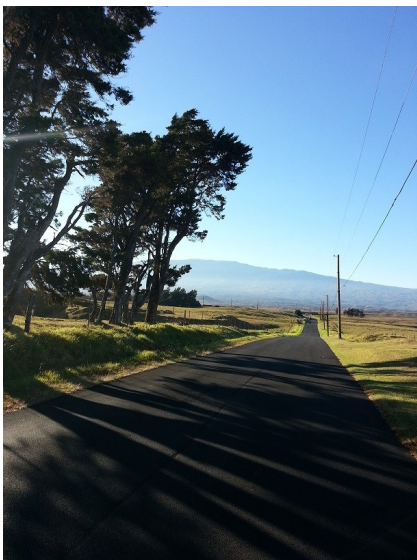
Mana Road in the early morning