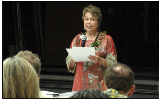
Clockwise from L: Senator visiting Green Energy Biomass Plant, Kauai; Senator speaking at the Waimea Community Association Meeting; at Pohakuloa Training Area; and a recent site visit to Kailapa Community, Kawaihae.