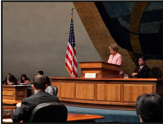
Senator Inouye's Moment of Contemplation August 31, 2017

Senator Lorraine Inouye Hawaii State Capitol 415 So. Beretania St., Room 210 Honolulu, HI 96813