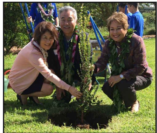
Planting a native tree with Governor Ige and his wife at the Waimea Middle School STEAM building dedication.