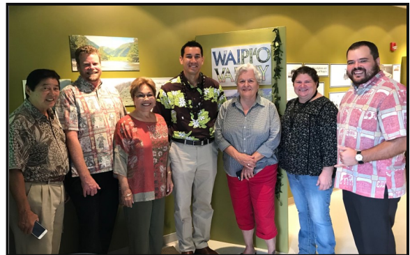
North Hawaii Education and Research Center (NHRC) Visit