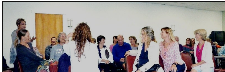
Senator addresses a domestic violence prevention meeting in Waimea.