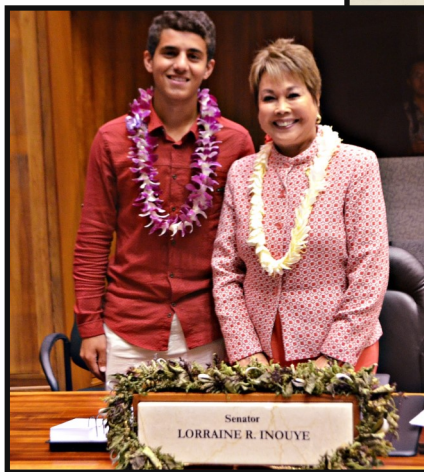
Photos from L to R: Senator speaking at Pali Highway dedication, giving her remarks at the Kapalama Pier dedication, the 2018 office staff, Parker School FLEX intern for a day, chairing a TRE hearing and braving the elements at the Hilo Pier dedication.