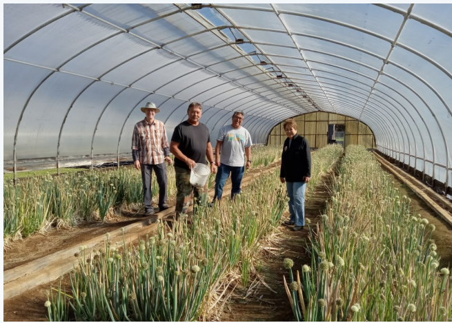
Senator Inouye is shown the CTAHR project to grow green onion seeds for Hawaii's farmers (above left). Senator Inouye with Hilo High School and DOE officials outside of the new Hilo

$6,900,000 in capital improvement project (CIP) funds was released by former Governor David Ige for major repairs and demoli-