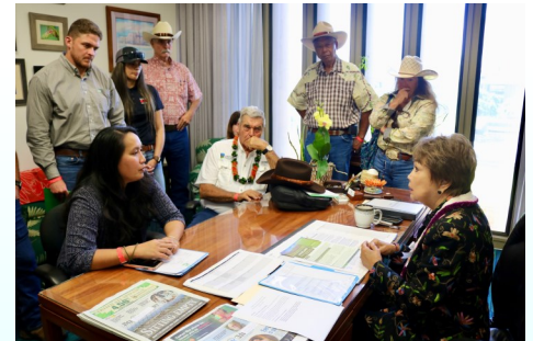
Cattlemen visiting Senator Inouye.