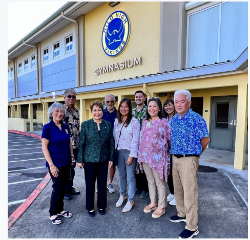
High School Gymnasium. Senator was there to look at possible locations for a new parking garage for the gym (above, right).

tion of existing structures at the University of Hawaii at Hilo's College of Tropical Agriculture and Human Resources Waiakea Research Station. The research station serves as an important site for conducting research on agriculture and floriculture production in Hawaii.