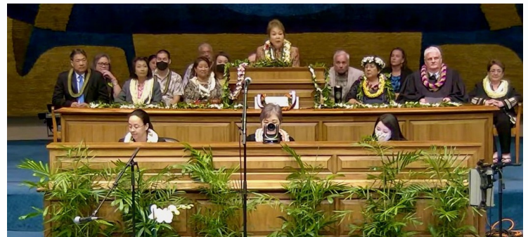
Senator Lorraine R. Inouye at the President's podium at the start of the 2023 session. This is preliminary before all Senators are sworn in.