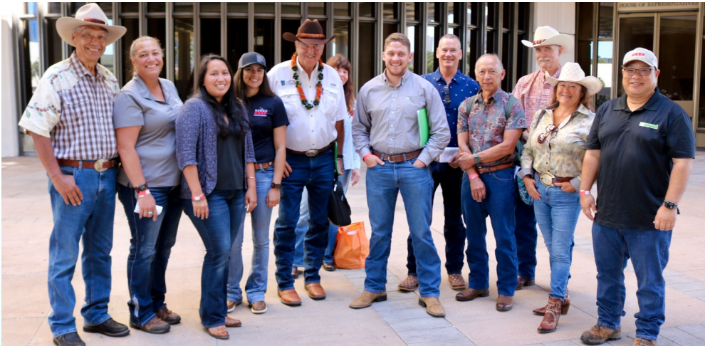
Members of the the Hawaii Cattlemen's Council visited the State Capitol on March 13.