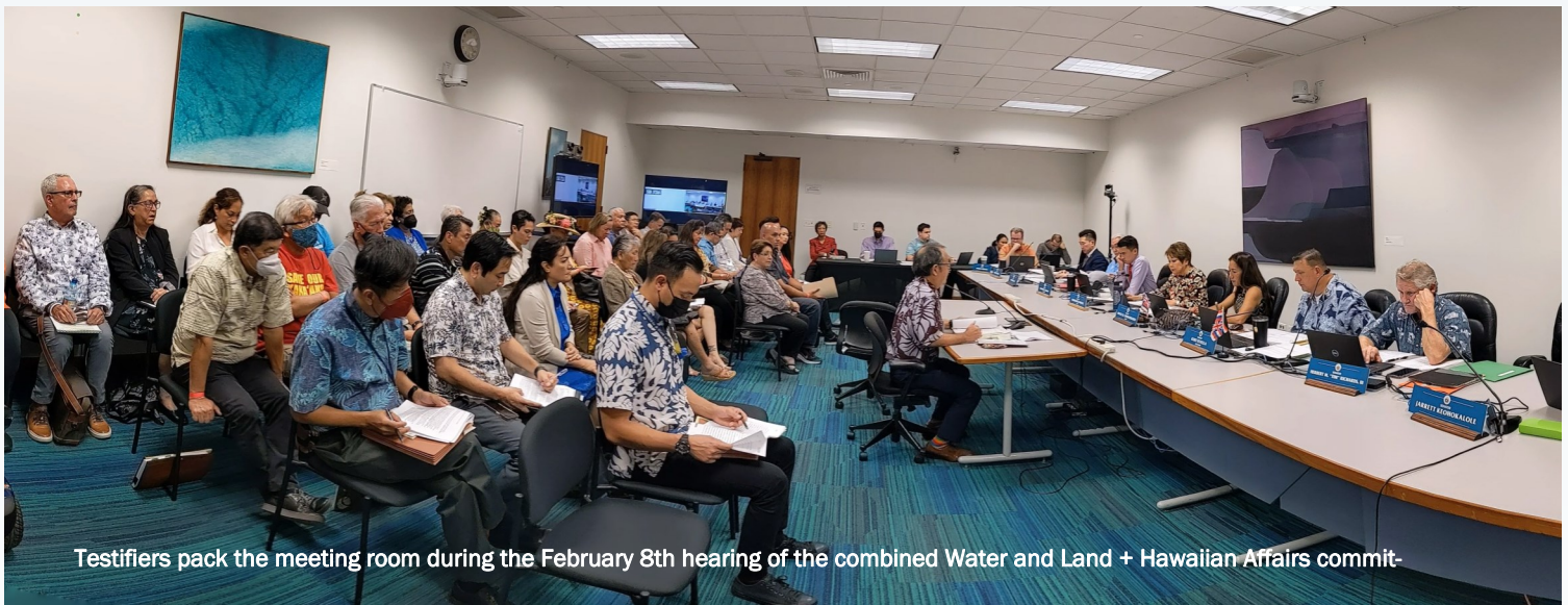
Testifiers pack the meeting room during the February 8th hearing of the combined Water and Land + Hawaiian Affairs committee.