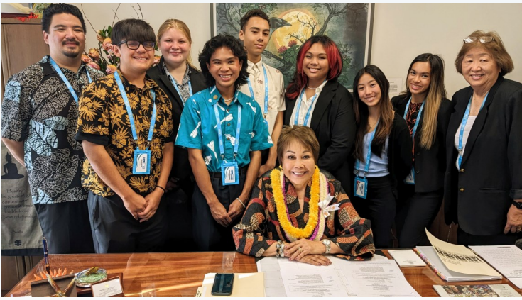
Hilo High School students (above) and Waiakea High School (below).