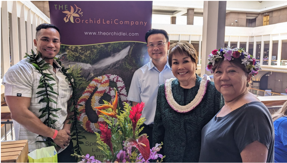
It was Tourism Day at the capitol on March 10 where industry organizations and some state agencies set up informational displays like the one from the Orchid growers.