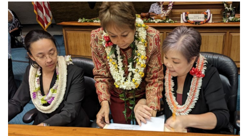
With Senate Clerks on Opening Day.