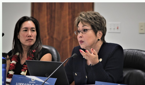
The Senate Transportation Committee hears many bills on all aspects of transportation. Shown with Senator Maile Shimabukuro from Oahu.

SB 406 – Exempts DOT from BLNR approval for highway purposes SB 407 – Appropriation for Hawaii County Prosecutor. In WAM. SB 408 – Amending Definition of an auto-cycle to include a three wheeled vehicle. Deferred TRS