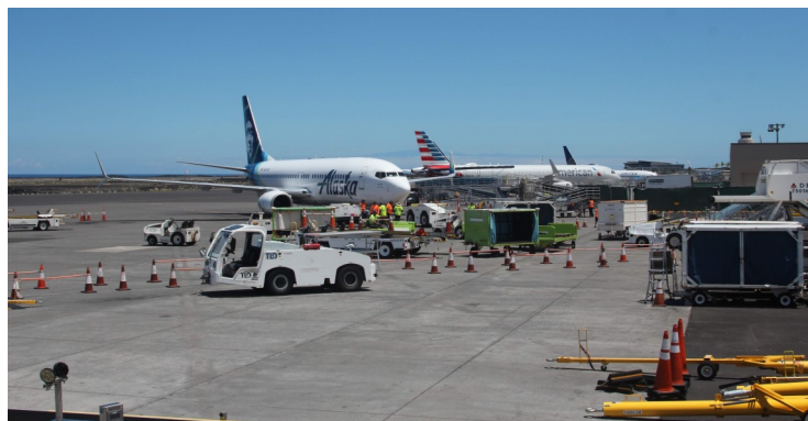
A number of improvements are coming to the airport in Kona.

Or send your email address to seninouye@capitol.hawaii.gov