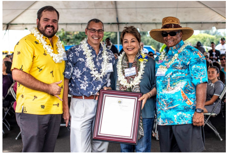
Senator Inouye with Young Bros. representative and members of Raymond Alapai’s family whom a tugboat bears his name.

HB 1180 – $60 Million allocation for disaster relief funding for the Puna area due to the 2018 volcano eruption.