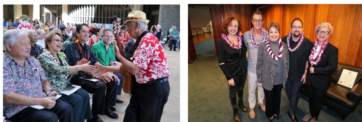
(Left): With fellow Senators at the Capitol’s 50th Anniversary Commemoration; (Right): Senate chamber with the Grammy Award winning singing group Manhattan Transfer.

The intention of this proposed law is to increase public safety. In 2018, 117 people were killed statewide in a number of traffic accidents, 43 of them pedestrians. Photo red light systems are used throughout the world and in the United States. They have proven to be reliable, efficient and effective in identifying and deterring those who run red lights.