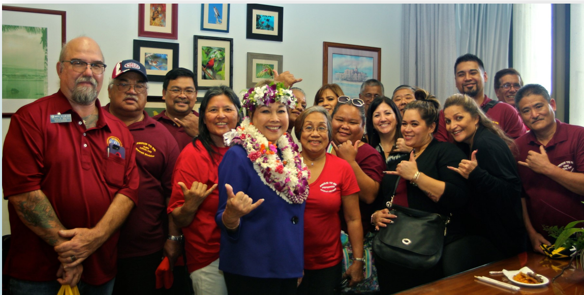
My supporters from the Big Island ILWU came to visit me on opening day, January 16.