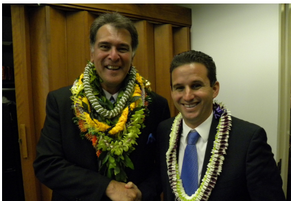
Senator Galuteria with Lieutenant Governor Brian Schatz on Opening Day of the Legislative Session