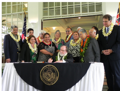
Signing of the OHA Settlement Bill (SB 2783) on April 11, 2012 at Washington Place

TOTAL DISTRICT 12 FUNDING FOR FY 2012 & 2013 $105,356,000