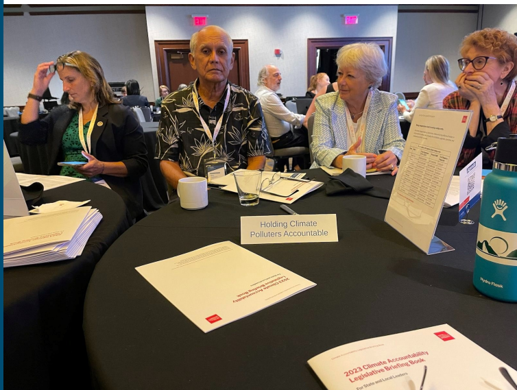
On Aug. 10-11, Sen. Gabbard attended the NCEL National Forum (National Caucus of Environmental Legislators) in Indianapolis, with legislators from across the country.

The 2023 NCEL National Forum (National Caucus of Environmental Legislators) took place Aug. 10-12. NCEL is a nonpartisan network created by and for state legislators who are committed to protecting and conserving the environment. This annual event brings state legislators together from across state and party lines to discuss common environmental concerns. The Caucus serves as a resource on environmental issues by providing legislative research and organized events, in addition to facilitating collaboration between lawmakers working on similar issues. One of the highlights of this conference was the outpouring of aloha from all the attendees for Maui... and the shared sense of how to prevent this type of thing from ever happening again – anywhere.