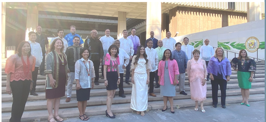
Every year, pre-COVID, the legislators of Filipino ancestry take a ceremonial photo in front of the Capitol. The photo was then usually featured as a cover for an issue of the Fil-Am courier, the Filipino community's foremost paper. This year, the photo shoot was expanded to include ALL of the Joint Filipino caucus.