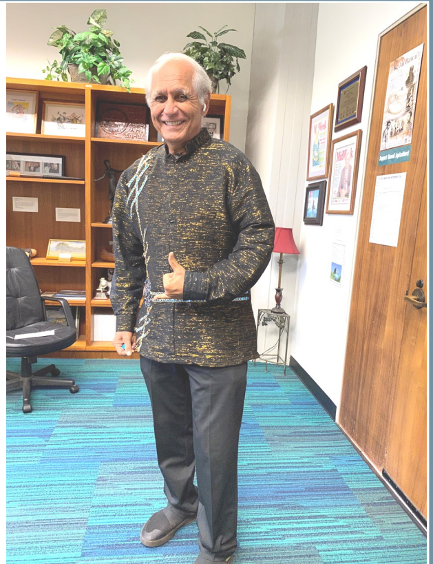
Senator Gabbard donned his barong shirt and stopped for a quick pose before heading out to meet his colleagues and fellow members of the Filipino Legislative Caucus, who are mixed racially and ethnically, and have the common goal of helping the Filipino community who make up about 25% of Hawaii's total population. (February 22, 2022)

I'm pleased to announce I received a letter from the governor today, informing me that he's released $135 million in funding for CIP funds I requested to widen Farrington Highway. Funds will be used to finance land, and for additional design and construction to widen Farrington Highway from Kapolei Golf Course to Fort Weaver Road. This will greatly enhance driving conditions for those of us who travel these roads on a regular basis. In addition, the governor wrote to let me know he's released $1.7 million for Fort Barrette Road improvements! Funding will be used to finance construction for Fort Barrette Road improvements from the vicinity of Kama'aha Avenue to the vicinity of Farrington Highway. Mahalo, Gov!