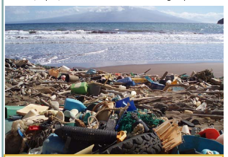
Greenpeace Arctic Sunrise returned to Honolulu from Kahoʻolawe on October 24, 2018, after collecting an estimated 2.5 tons of debris!

Most of the world's plastic waste is generated in Asia, but America, Japan, and the EU are the world's largest producers