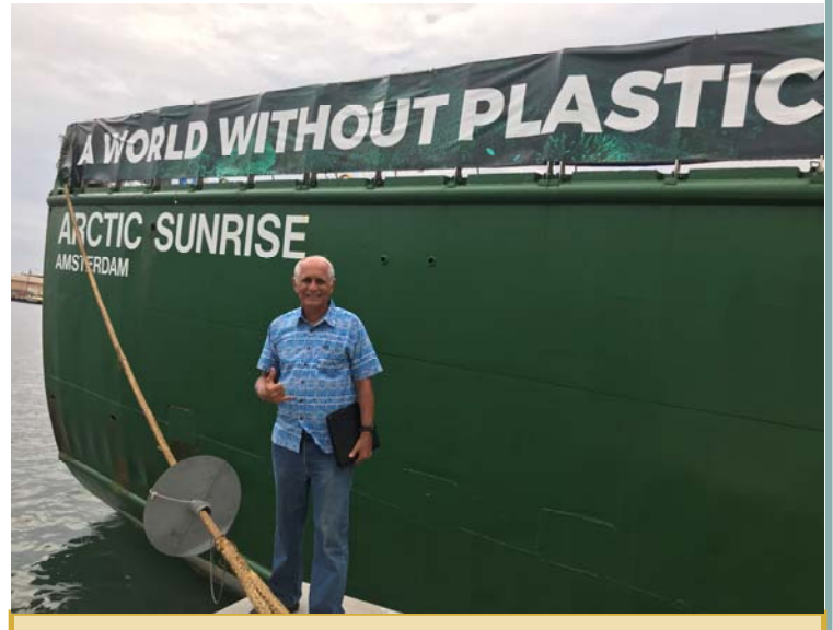
Sen. Gabbard was invited aboard the Greenpeace Arctic Sunrise Ship at Brewers pier 12 Honolulu on October 29, 2018, to discuss plastic pollution with Greenpeace and other local leaders.

of plastic packaging waste per capita. The world's ability to cope with plastic waste is already overwhelmed as seen by the closing of recycling markets in China and Thailand. Even when recycling markets were open, only 9% of the 9 billion tons of plastic produced has been recycled. If the growth in plastic production continues at its current rate, the plastics industry will likely account for 20% of the world's total oil consumption by 2050.