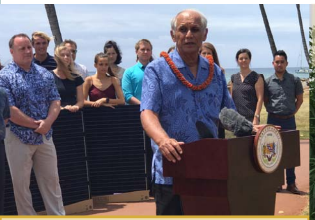
Sen. Gabbard spoke during a press conference on May 9 at Magic Island to applaud Hawai'i as the first state to lead the country to a zero-emissions clean economy and statewide carbon neutrality by 2045.

Pesticide Regulation (SB 3095) This is a first-in-the-nation law that will ban the dangerous pesticide, chlorpyrifos starting in 2023. The bill also includes restricted use pesticide reporting, a pesticide drift study at 3 schools, and 100 ft. pesticide buffer zones around all public schools. The bill will increase the cap of the Pesticide Use Revolving Fund from $250K to $1M for pesticide training, creates two new positions in the Department of Ag, and puts $300K toward outreach and education.