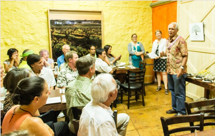
Sen. Gabbard attended a luncheon and spoke at the "Outdoor Circle Celebration Party" for the Passage of SB 632, establishing environmental courts, on July 25, 2014.