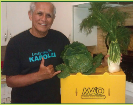
Senator Gabbard with gift box of organic Ma'o Farms veggies from Office of Hawaiian Affairs given to Legislators on Opening Day, January 16th.