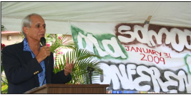
Sen. Gabbard addressed the audience at UH West Oahu's "Samoa Ala Mai Conference" on Saturday January 31, 2009.