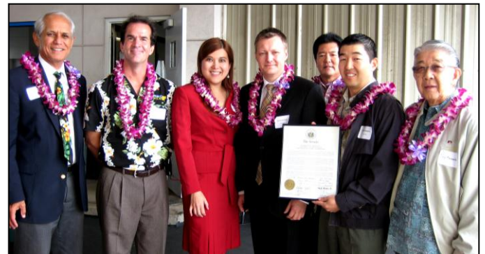
Sen. Gabbard honored Waipio's Tony Group Autoplex on February 23rd upon the blessing ceremony for a 298 kW solar electric system by REC Solar, which powers all 3 dealerships.

SB 1671 would align our energy policy with a clean energy and sustainable future by prohibiting new or expanded fossil fuel power plants beginning July 1, 2009. There would be an exemption for fossil-fuel based electric generation units of up to 2 MW (megawatts) for emergency purposes. If this bill passes into law, it will be the first in the nation.