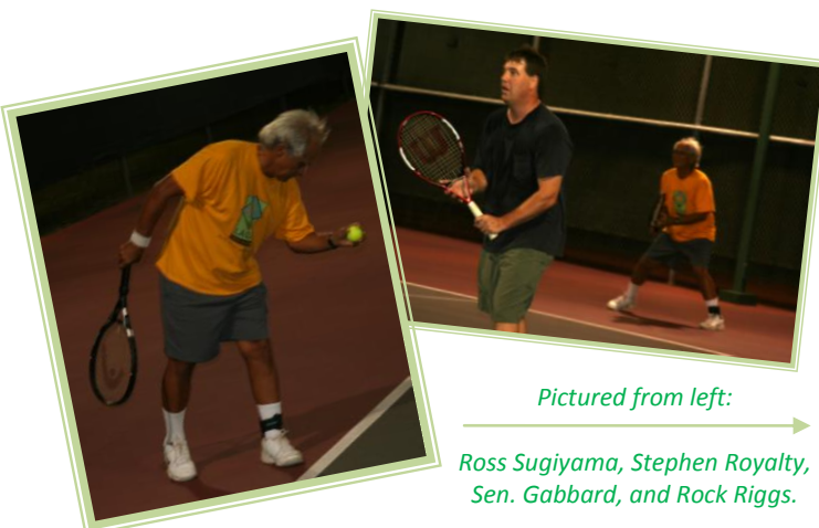
Pictured from left: