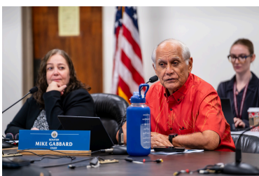
Senator Gabbard making a comment during the session.

An information briefing was held with the Committee on Energy and Environmental Protection to discuss the new landfill site on Oahu. The City and County of Honolulu's Department of Environmental Services (ENS) is required to name a new landfill site by December 31, 2024. The issue raised concerns on our efforts towards waste conversion technologies - something that I am a personal advocate for. The negative effects the landfill will have on surrounding communities also needs to be clearly identified before the plan moves forward. You can view the entire hearing on YouTube .