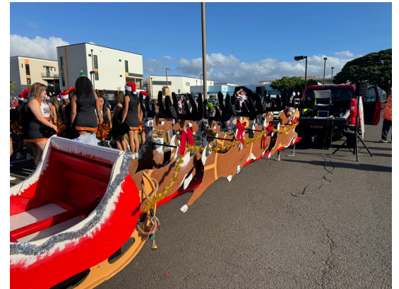
Students from Campbell HS with our reindeer sleigh

The Ewa Beach community brought Christmas to the streets. As the name suggests, a huge mahalo to all of our Ewa Beach partners and organizations for participating, and showing off your festivity to the community. This truly could not have been done without everyone's cooperation - from HPD clearing traffic and keeping the parade safe to all the students from James Campbell High School for attending! We hope you and your families had fun seeing all of our guests. Turnout was incredible, so we are looking forward to hosting another one next year!