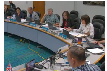
Senators in session

To kick off the legislative hearings this year, the committee on Hawaiian Affairs presented their plans for the coming fiscal years. One of the most important points of discussion for myself was and will continue to be the development of Hawaiian lands for the benefit of the people and culture of Native Hawaiians. Plans aimed at bolstering Native Hawaiian education through schools and also through infrastructure were discussed. You can view the entire discussion on YouTube .