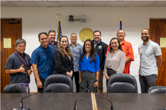
Senator with members of the caucus at the meeting

On January 3rd, I convened with the Working Families Caucus to discuss the 2025 bill package. Included within this package were topics such as preschool access and family leave, SNAP access, free school meals, minimum wage, child tax credit, and worker protections. The programs discussed in the meeting are meant to help our working class combat the rising costs of living so that security is no longer an issue that is constantly creeping behind them. However, these organizations need advocacy from us - they cannot sustain their missions alone. This caucus meeting was just one step forward, but there is still work to be done for the foundation of our workforce.