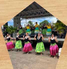
The lovely Ewalani Hula Maids graced the stage with a number of performances.