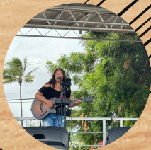
The music was jammin' and speeches from special guests were emotional.