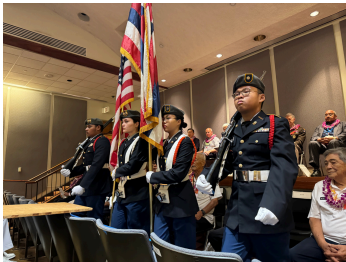
The commencement of the memorial service.

I attended the 30th anniversary of the Korean and Vietnam War Memorial and the 71st anniversary of the Korean War Armistice in the auditorium at the State Capitol. Please take a moment to remember our fallen soldiers, many of who were from Hawai'i and gave their lives for the freedom that we enjoy each day. Mahalo Korean War Foundation for a remarkable event. It was an honorable way celebrate our fallen. KHON has provided news coverage of the memorial at the State Capitol in its article .