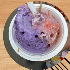
We had some ono food at the event, including some shave ice to help cool down on a nice sunny day.