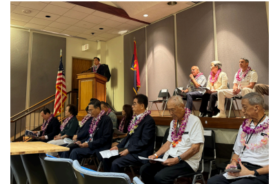
Special guests spoke on the history and honored our dignitaries for their service.

I attended the 30th anniversary of the Korean and Vietnam War Memorial and the 71st anniversary of the Korean War Armistice in the auditorium at the State Capitol. Please take a moment to remember our fallen soldiers, many of who were from Hawai'i and gave their lives for the freedom that we enjoy each day. Mahalo Korean War Foundation for a remarkable event. It was an honorable way celebrate our fallen. KHON has provided news coverage of the memorial at the State Capitol in its article .