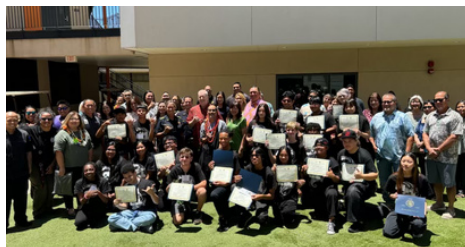
The Weed and Seed program continued its Culinary Arts Summer Program this year! The current and future James Campbell High School students received certificates of completion (pictured on the left).