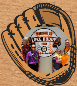
The dug out and scoreboard reveal was the final home run. What a beauty!