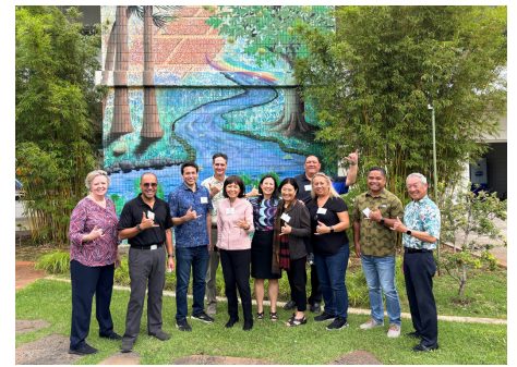
From left to right, WAM Committee members at KCC, LCC, and HCC