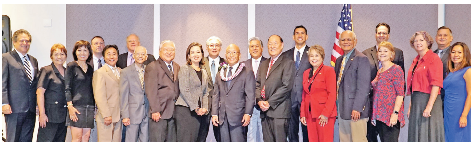
Lower left: Sen. English and members of the Senate with Judge Keith Hiraoka during the Second Special Session of 2018. Honolulu, O'ahu. October 25, 2018.