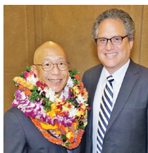
ipated in mediations and briefed and argued appeals before the Hawai'i Supreme Court, the Intermediate Court of Appeals and the Ninth Circuit Court of Appeals in San Francisco.