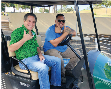
Sen. English and members of the Temporary Commission on the 13th Festival of Pacific Arts and Culture on a site visit to Kaka'ako Waterfront Park. Honolulu, O'ahu. October 26, 2018.