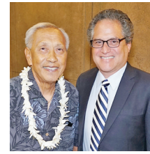
the best in their new roles."