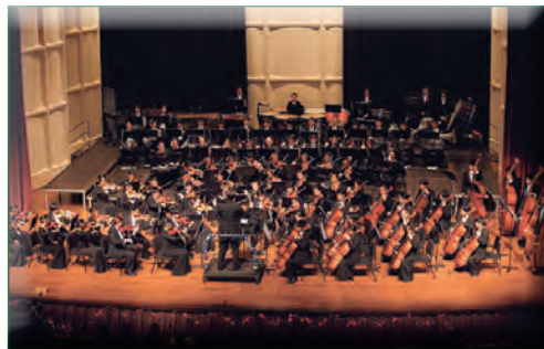
One of the incredible student orchestras that have performed at the Nakasone Performing Arts Center.