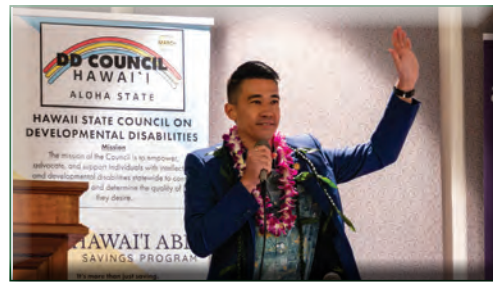
Clockwise from top...Senator Elefante speaking at the Advocacy Day Press Conference at the Capitol on March 7th.