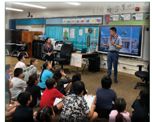
Students from Wai'au Elementary School learn about the legislative process from Senator Elefante on Career Day.