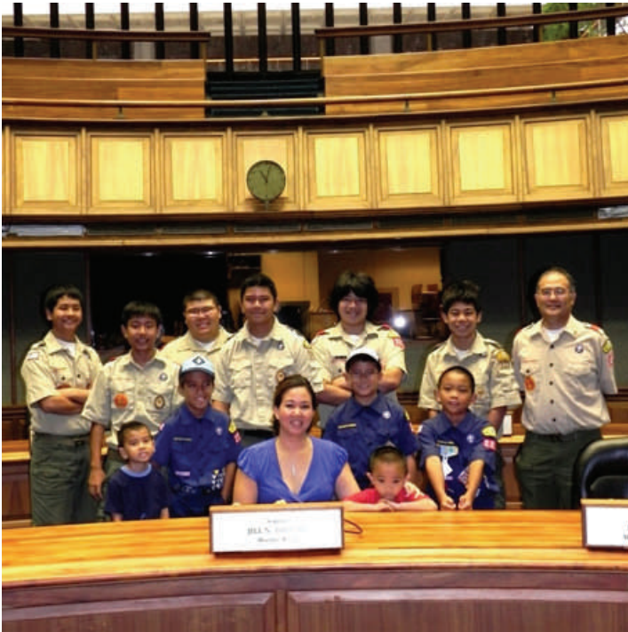
Cub Scouts and Boy Scouts from Troop 229 in Kaneohe area visited Senator Tokuda at the Capitol where they learned about the legislative process and talked about why public participation is important.