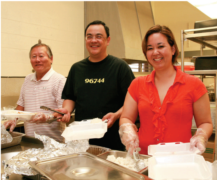
Rep. Ken Ito, Rep. Pono Chong and Senator Tokuda volunteered at the 51st Annual Kiwanis Club of Kaneohe's Mother's Day Pancake Breakfast.