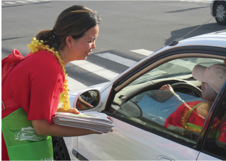
Senator Tokuda volunteering and selling Kids Day Newspapers as a fundraiser for Parents and Children Together (PACT) Kaneohe.