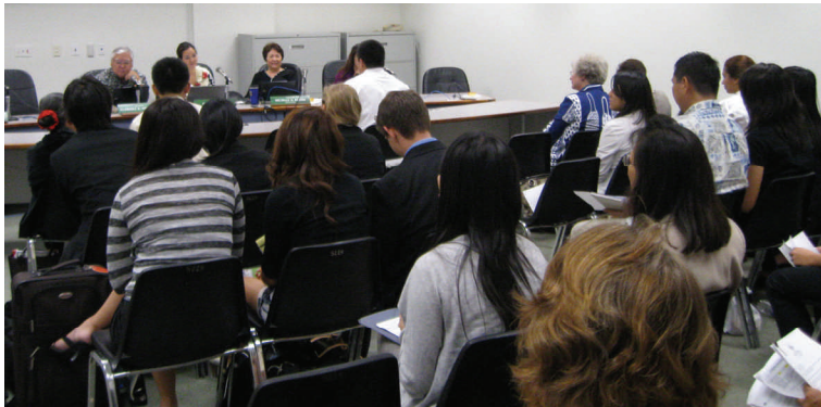
The Senate Committees on Education and Agriculture held a Legislative Youth Engagement Day, where high school students were encouraged to visit the Capitol and prepare and present testimony on various House bills being heard. Several schools participated including: Castle, Kalaheo, and Kailua High Schools.