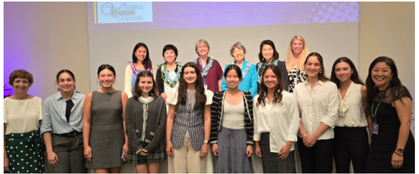
With students from Roosevelt, Moanalua, Punahou, Farrington, and IPA-Kapolei