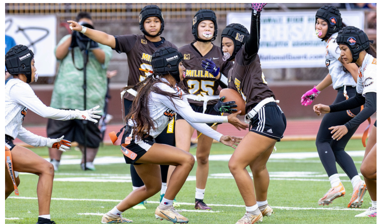
HHSAA Semifinal: Mililani vs. Campbell

Congratulations to each young girl who participated and competed this year, including my granddaughter. While the season may be over, I want to thank every player for blazing the trail for Girl's Athletics with grit and determination!