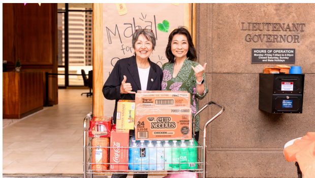
With Lieutenant Governor Sylvia Luke

Lieutenant Governor Sylvia Luke hosted her 3 rd Annual Food Drive Fest on April 16 th . This event brings together legislators and local business to support the Hawai'i Food Bank - raising awareness and providing essential food assistance.