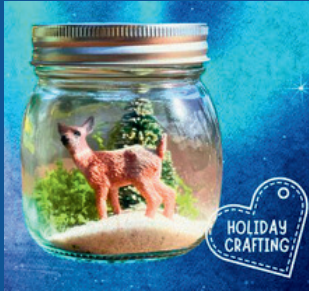
Winter Wonderland in a Jar

This holiday season, I encourage you to enjoy festive family events at the Mililani and Waipahu public libraries! Visit during December for creative crafts and holiday fun for all ages.