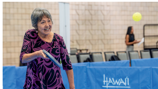
Above, breaking in the new pickleball courts with a friendly match!

The HCC has been instrumental in supporting recreational and tourism goals through its expanding sports courts program, which includes facilities for volleyball, basketball, badminton, and now, pickleball. As pickleball continues to grow in popularity, these new courts are a fantastic resource for residents to stay active, connect with others, and enjoy quality recreational time in a convenient, indoor space. Mahalo to the HCC team and everyone involved for bringing this vision to life. Here's to many games filled with friendly competition and aloha spirit!