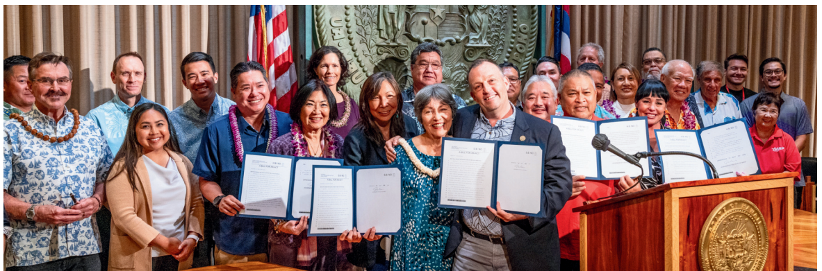
Above, several measures were signed into law to enhance the protection and care of keiki and kūpuna by Gov. Green surrounded by legislators, state officials, and community members.