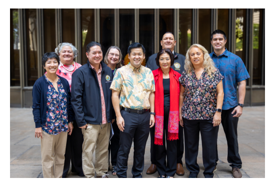
Members of the Kupuna Caucus on press conference day

At the Kūpuna Caucus press conference, food and health security were the highlights of our bill package. A significant number of our Kūpuna rely on low-income welfare programs to support themselves up which is why the bills included in our package aim to restore SNAP benefit levels, fund in-home services, and extend rent supplement programs. You do not have to be a member of the caucus to attend these conferences - many who came out simply wanted to provide their perspective. Our package extends from SB877 to SB881. You are invited to support the bills you believe would improve quality of life for you or your loved ones.