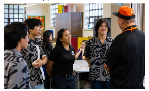
Sen. Fevella speaking with a team of JCHS students on their presentation

get ahead. Professional women from SSFM and STEMworks showed up to offer valuable career resources. Students were platformed to show off their approaches to engineering questions and programming - some of the most sought after fields of work in Hawaii. Inclusivity in STEAM is only going to grow more important, so mahalo to JCHS for recognizing it early.