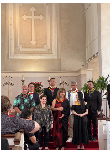
Board members during the investiture ceremony.

The Office of Hawaiian Affairs had their investiture ceremony last month to induct their board of trustees. It was only right for me to stop by to congratulate some friends on their new positions as board members. Native Hawaiians culture often gets sidelined, meaning students are leaving school knowing less and less about the history of our state and Ōlelo Hawai'i is fading away. There is a responsibility shared between OHA and myself to promote the rich culture of our islands. Let's wish our trustees the best for this upcoming year!