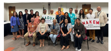
Senate and House legislators with HCIR.

On October 30, the House and Senate Filipino Caucuses met to receive updates from various community organizations to better prepare us for the 2025 Session. We were shown presentations about Filipino Culture and J1 Visas for Filipinos as part of an exchange program, and also heard from the Pamantasan Council at UH Manoa, the Filipino Chamber of Commerce, and the Hawaii Coalition for Immigrant Rights.