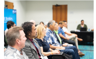
Audience present at the EET Briefing

On October 23, the committee on Energy, Economic Development and Tourism gathered to receive an overview of the current operations from the Hawaii Tourism Authority (HTA). This includes an overview of the HTA Board, rules and responsibilities of the Board, the Hawaii visitors and Convention Bureau, and the HTA budget. You can view the entire discussion on YouTube .