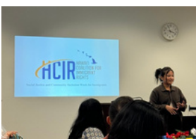
Presentation by Hawai’i Coalition for Immigrant Rights (HCIR).

On October 30, the House and Senate Filipino Caucuses met to receive updates from various community organizations to better prepare us for the 2025 Session. We were shown presentations about Filipino Culture and J1 Visas for Filipinos as part of an exchange program, and also heard from the Pamantasan Council at UH Manoa, the Filipino Chamber of Commerce, and the Hawaii Coalition for Immigrant Rights.