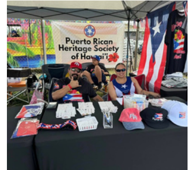
The Puerto Rican Heritage Society of Hawai'i had its own booth at the celebration.

The Annual Hispanic Festival is celebrated during Hispanic Heritage Month, which runs from September 15 to October 15. This year, the 32nd Annual Hispanic Festival is centered on reflecting Hispanic Americans' service and contributions to the history of our Nation, and was held at the AMVETS West Oahu Veterans Center. This annual event celebrates the contributions and achievements of Latinos and Hispanics by recognizing various elements of their rich culture as demonstrated through their traditions of faith, family, food, and hard work. Mahalo to all the volunteers and vendors for your contribution to making this years' festival a success!