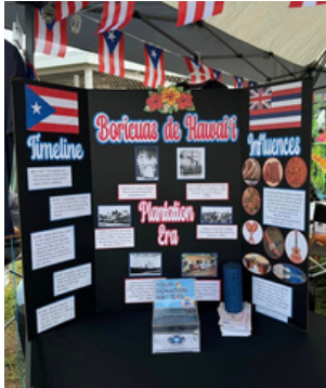
A display of showcasing the Hispanic influence in Hawai'i.

The Annual Hispanic Festival is celebrated during Hispanic Heritage Month, which runs from September 15 to October 15. This year, the 32nd Annual Hispanic Festival is centered on reflecting Hispanic Americans' service and contributions to the history of our Nation, and was held at the AMVETS West Oahu Veterans Center. This annual event celebrates the contributions and achievements of Latinos and Hispanics by recognizing various elements of their rich culture as demonstrated through their traditions of faith, family, food, and hard work. Mahalo to all the volunteers and vendors for your contribution to making this years' festival a success!