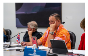
Senator Fevella during the EET-HWN Joint briefing

In June 2024, more than 1,500 customers were cut from their telecommunication services, including many homesteaders and businesses. Most of these customers were located in remote regions of the islands, with only 1 telecommunications carrier. The hearing features an overview of the future of telecommunications on Hawaiian Home lands, recent show cause order of the emergency proclamation, and an outline from Spectrum and Hawaiian Telcom on their contributions to enhancing services on Hawaiian Homelands. You can view the entire hearing on YouTube .