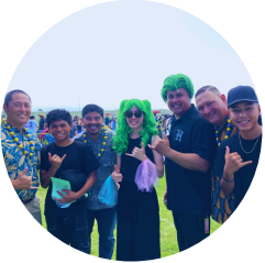
DOE students and faculty with district officials.