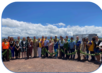
Kūpono Solar team, elected officials, and community members in attendance of the blessing.

Presently, Kūpono Solar is the largest storage facility of solar-plus battery on O'ahu. The dedication blessing that took place in West Loch, 'Ewa, was of a new 42 MW photovoltaic solar and a four-hour battery storage facility. Essentially, this