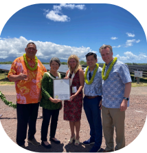
I, along with other state senators, presenting the Senate certificate to Kūpono Solar.

Presently, Kūpono Solar is the largest storage facility of solar-plus battery on O'ahu. The dedication blessing that took place in West Loch, 'Ewa, was of a new 42 MW photovoltaic solar and a four-hour battery storage facility. Essentially, this