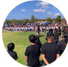
Students performing during the graduation ceremony.

It was a pleasure to be in the audience with Department of Education staff, along with families and friends in our community. The support of our keiki is needed on all levels of society. I appreciate the time and effort invested in our keiki in fostering creativity and instilling knowledge to better prepare them for their future.