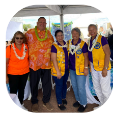
Sen. Fevella with Ewa Beach Lions Club and JCHS rep.

renewable clean energy project will aid in stabilizing energy costs and reduce fossil fuel usage. It also delivers renewable energy to power ten thousand homes while reducing more than fifty thousand tons of carbon dioxide- annually.