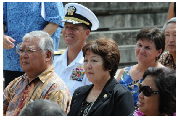
Senator Kidani with Legislators, families & special guests during the Hawai'i dedication of the Honor & Remember Flag

Honor and Remember, Inc., P.O. Box 16834 Chesapeake, VA 23328-6834