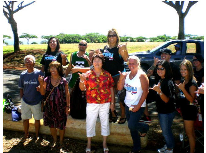
Ladies from Po'okela & Family