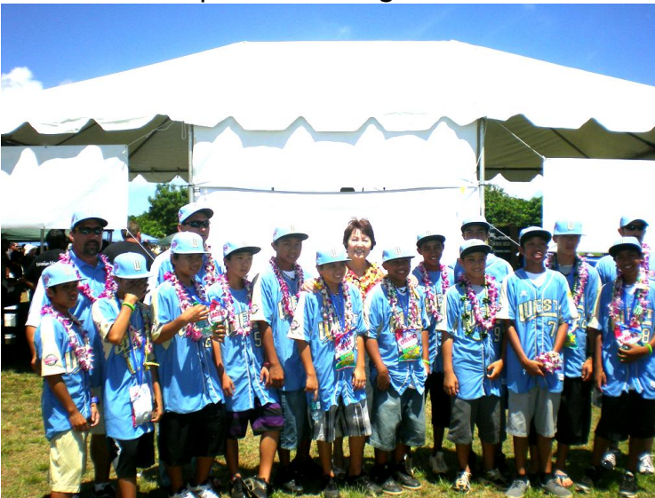
Waipi'o Little League Team