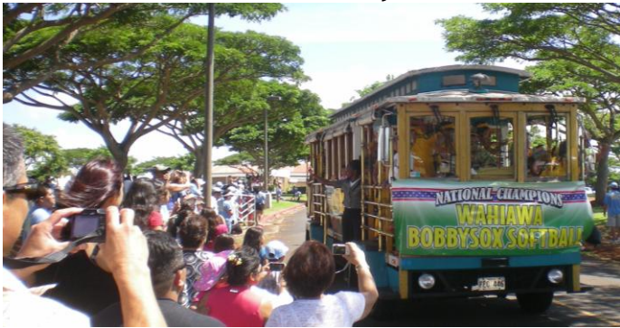
Wahiawa Bobby Sox