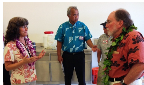
Governor Abercrombie and Senator Kahele tour the facility of PBARC.

The state's investment will assist PBARC in moving the project to pilot scale as a prelude to commercial production.