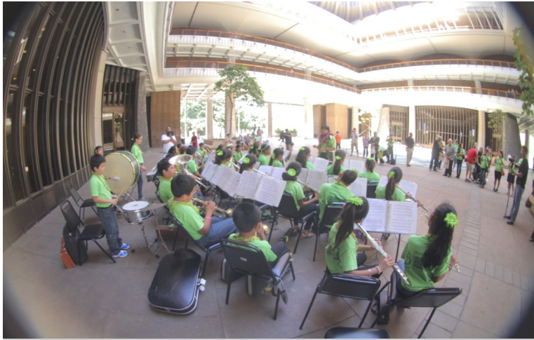
Waiakeawaena Elementary School Band performs at the Hawai'i State Capitol.

On May 1, 2013 we had the honor of hosting the Waiakeawaena Elementary School Band at the State Capitol. The young and talented boys and girls of Waiakeawaena Elementary performed several renditions for the Big Island Delegation along with other members of the legislature, their staff, and the general public.