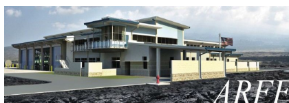
Rendering image of the new ARFF Facility at the Kona International Airport at Keahole.

The CIP budget included an appropriation of $19M provided by both the State of Hawai'i and the Federal Government. I can assure you that my office will stay on top of this project and will assist the efforts of both State and Federal agencies until this project grows to