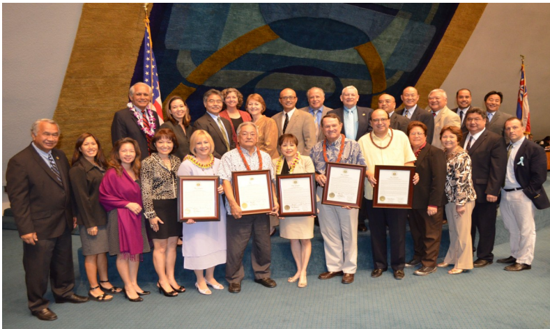
On April 1, 2013 the Hawai'i State Senate recognized and congratulated Challenger Center Hawai'i and the W.M. Keck Observatory. Both organizations marked their 20th Anniversary.