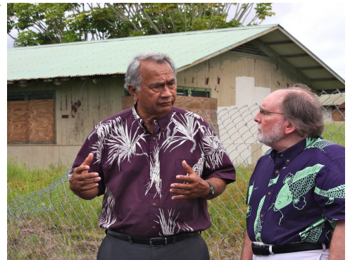
In June 2012, Senator Kahele and Governor Abercrombie visited the dilapidated units on Block 4 at the Lanakila Housing complex in Hilo.

I am pleased to announce on April 5, 2013 Governor Abercrombie released the $7.5M to the Hawai'i Public Housing Authority to initiate the first phase of the restoration of Block 4 at Lanakila Homes. The Abercrombie Administration is dedicated to accelerating Hawai'i's economic recovery through a broad-ranged series of CIPs called the New Day Projects .