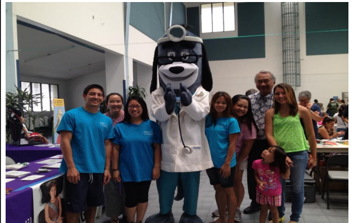
Senator Kahele at Sangha Hall for the East Hawaii Coalition to prevent child abuse and promote pono health measures.