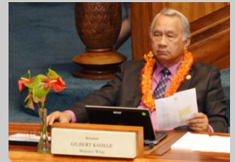
Adjournment Sine Die