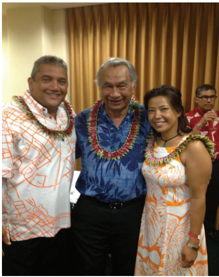
Senator Kahele at the Hilo Medical Center Foundation 10th Annual Wine, Cheese, Chocolate & More event with Mayor Kenoi and First Lady Takako