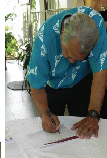
Senator Kahele at the Native Hawaiian Roll Commission Official Signing and Celebration at Washington Place