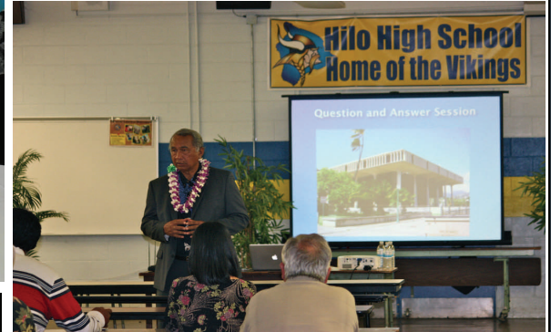
Senator Kahele provides the community with a Legislative update at Hilo High School cafeteria