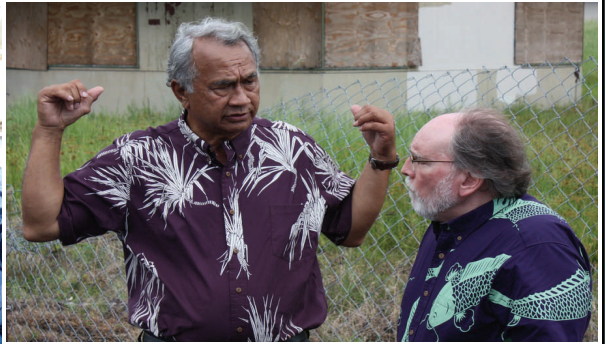
Senator Kahele gives Governor Neil Abercrombie a first hand look at the dilapidated Lanakila Homes Public Housing Units