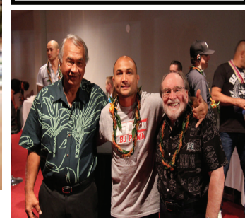
Hilo Native BJ Penn opens the first signature UFC Gym in Honolulu