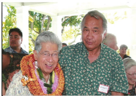
Senator Kahele attends a luncheon at Washington Place honoring Senator Daniel K. Akaka's 36 years in Congress