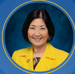
SENATOR SHARON Y. MORIWAKI