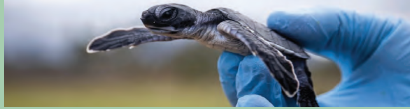
Several Honu nested at Marine Corps Base Hawaii and Bellows

I am pleased to expand my scope by serving on the Hawaii Invasive Species Council, and by supporting their work with the Department of Agriculture to fight an infestation of coqui frogs in Waimānalo. The frogs have become established over the last year in four acres of very steep valley which are challenging to access. They have hand-caught over 500 frogs and have targeted visible frogs with hand-spraying of citric acid (a common ingredient in food). They then took advantage of an unspent day of helicopter services for fire control to do a soaking with the citric acid using wildfire fighting equipment. This will hopefully reduce the population in the steep, inaccessible areas.