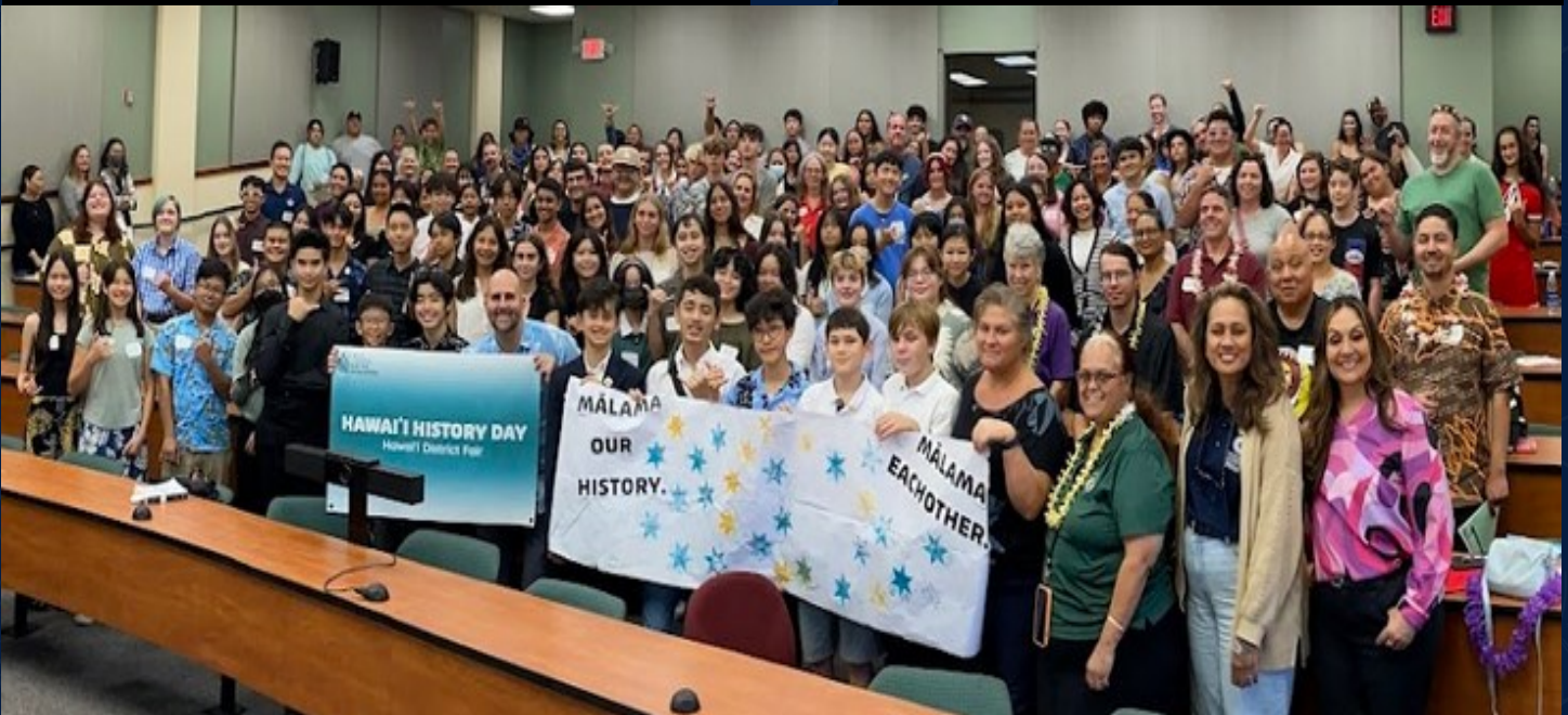
Rep at Hawai'i History Day with Students, Teachers, Parents and Volunteers