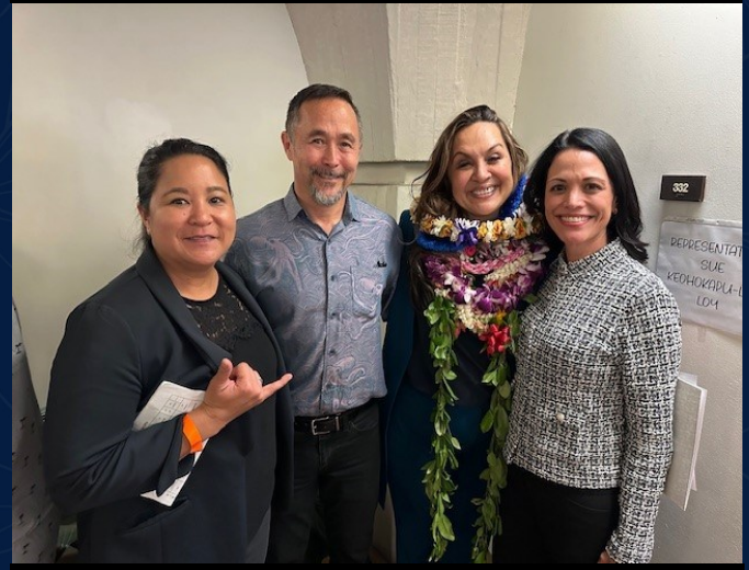
Opening Day with the Hilo Hospital Group