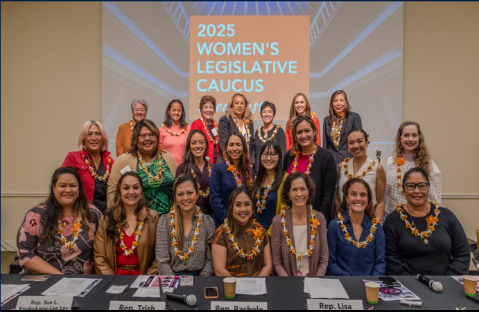
Group Photo of the 2025 Women's Legislative Caucus