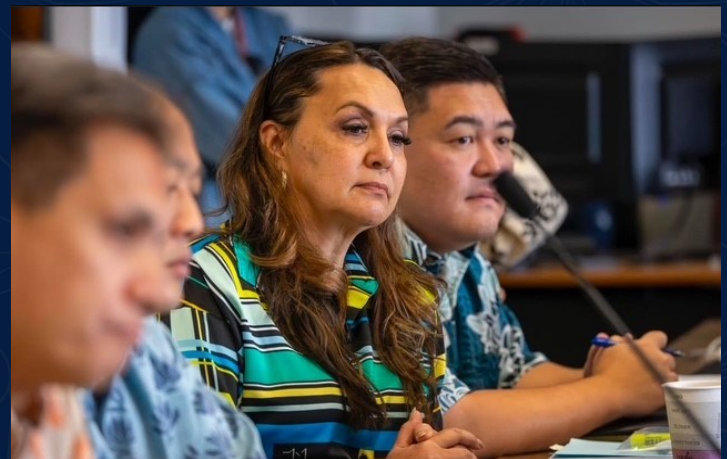
Rep in Finance Committee Hearing