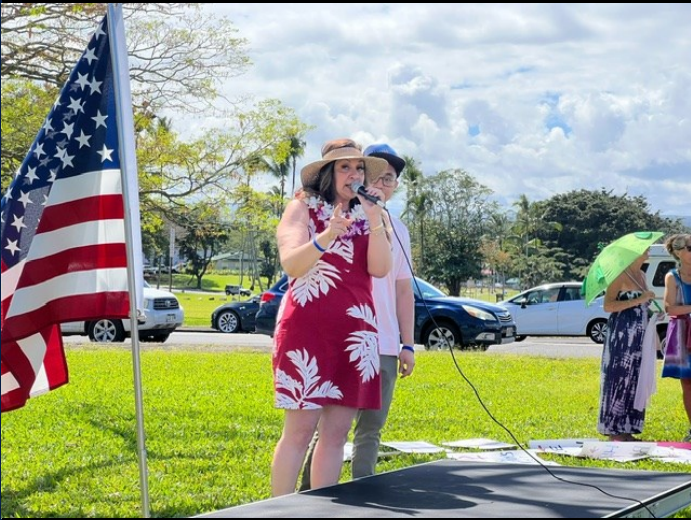
International Women's Day—Hilo