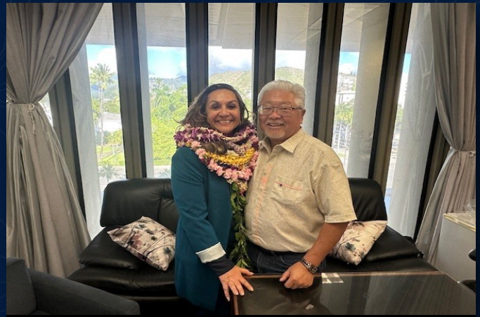
Rep with former Rep. Onishi on Opening Day