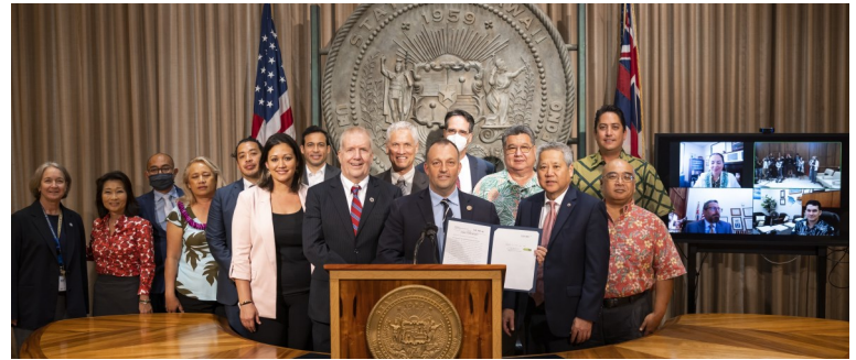
Governor Green signing Act 1 into law