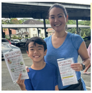
LFA Canvassing in Kāne'ohe