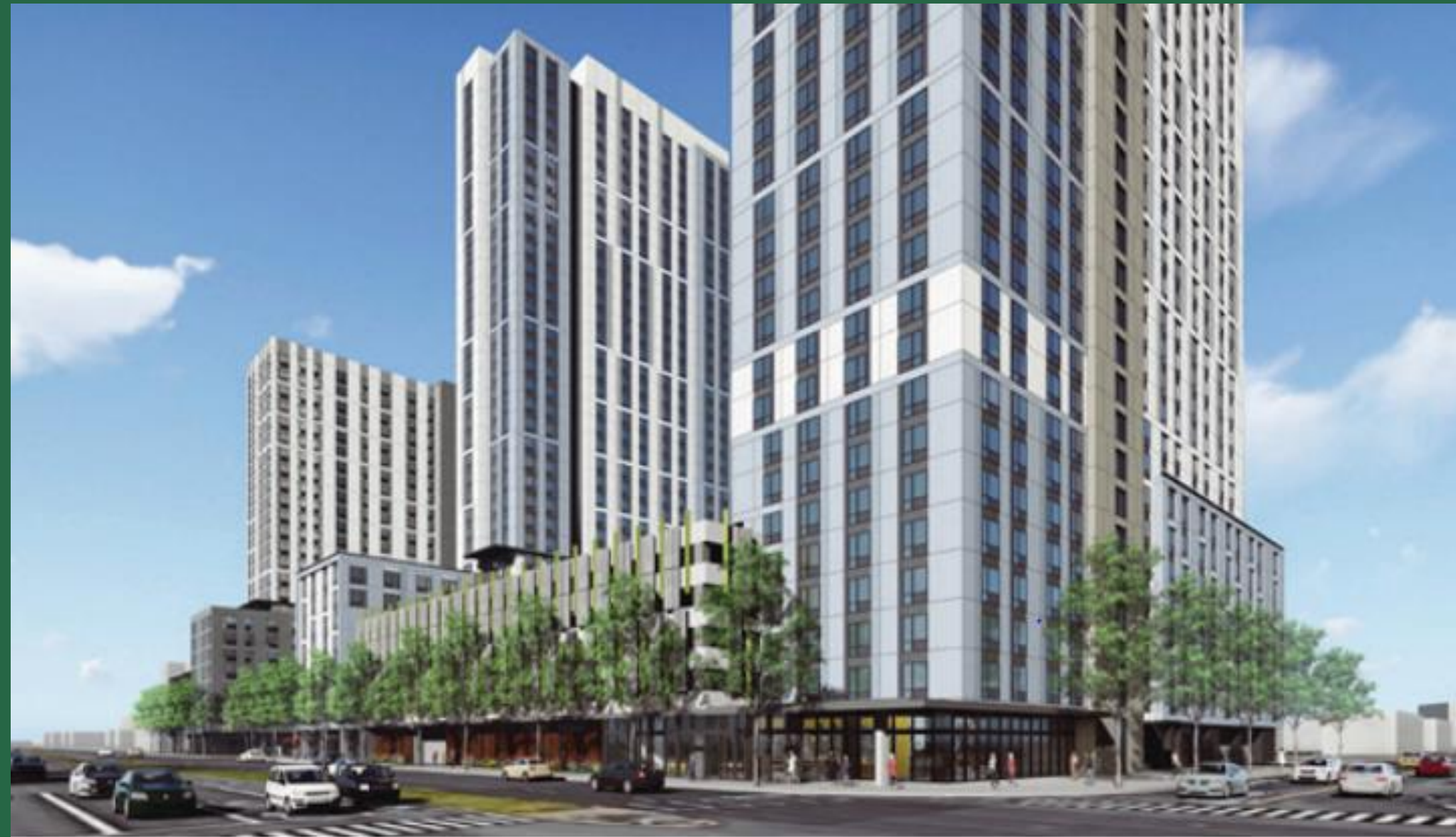
Rendering of Mayor Wright Homes.